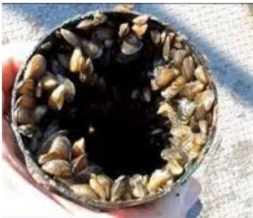
Water intake pipe in Ohio