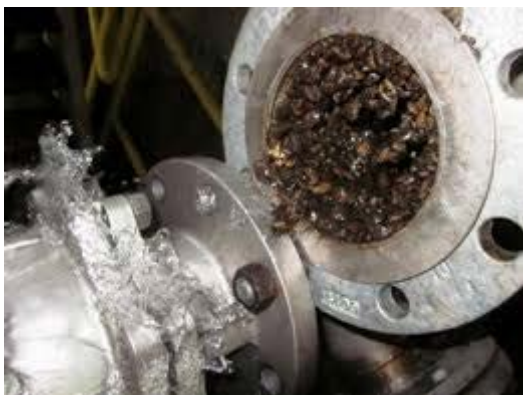
A three-foot-diameter pipe clogged by zebra mussels in less than three months (U.S. Department of Energy)

Zebra mussels can clog surface water intake pipes of public or semi-public water systems, or even intake pipes in an infested river or lake serving private homes or cottages. This can cause a loss in pumping ability or obstructed valves, sometimes leading to plant shutdowns. Zebra mussels can also increase corrosion of cast iron pipes and are a safety hazard when hydrant systems are clogged and fail to deliver fire-fighting water.